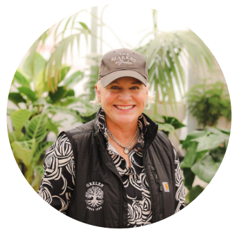
OWNER/CEO THE MARKET AT GRELEN