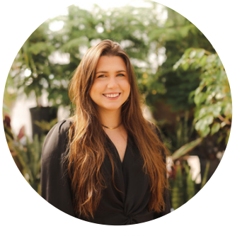
DIRECTOR OF MARKETING EVENTS & PROPERTIES